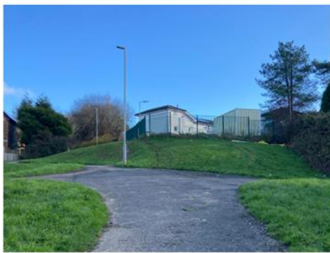
View 3 - Before