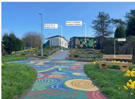
View 3 - After (option 2)