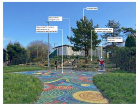
View 3 - After (option 1)