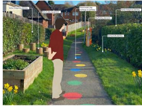
View 1 - After