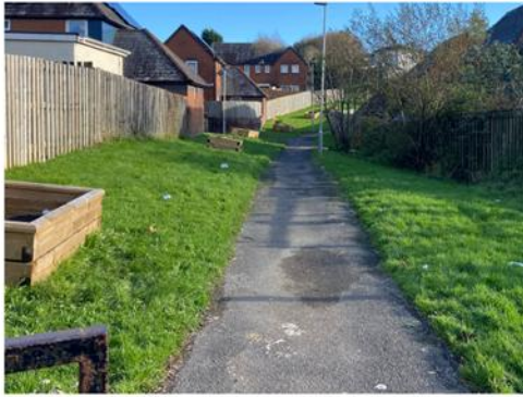
View 1 - Before