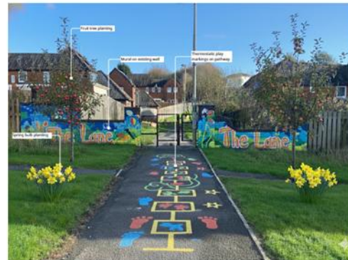
View 2 - After