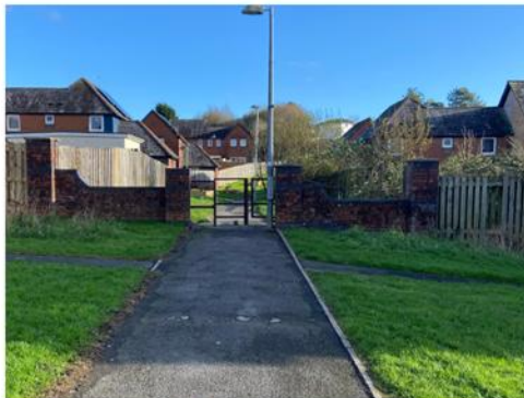
View 2 - Before